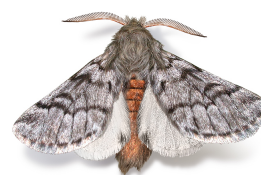
Thaumetopoea pityocampa Lepidoptera: Thaumetopoeidae

Adults appear in summer. The female lays the eggs (200 units) on the pine needles and protects them with the scales from its abdomen. A month later larvae emerge. After four moults they build the definitive nest at the beginning of winter where they will remain until the end of February. It is then when they will begin the descent to bury themselves and start the pupation. There is just one generation per year. Damage is caused by larvae feeding on pine needles producing defoliation and tree weakening becoming thus undefended in front of fungi and other insects. On the other hand, larvae are covered by stinging hairs that disperse in the air and on the ground.